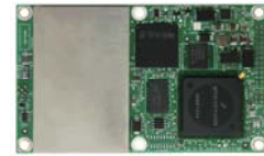
Advanced Trimble® BD970 OEM is a compact multi-constellation receiver designed to deliver centimeter accuracy to a variety of applications.